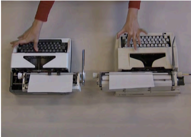
Dina Danish, »Type Sonata«, 2011 Einkanal Video/ single-channel video, 2:54 min, Euro 4.600,-