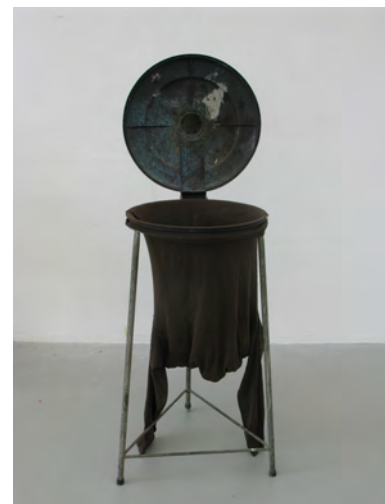
Frank Koolen, »The Great Escape«, 2012, 50 x 38 cm, Foto auf Aludibond / Photo on dibond, Auflage von / edition of 3 + 1 Euro 650,-