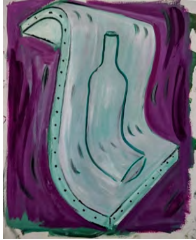
Pim Blokker, »Drunken Canvas«, 2015 50 x 40 cm, oil on paper on wood, Euro 1.600,-