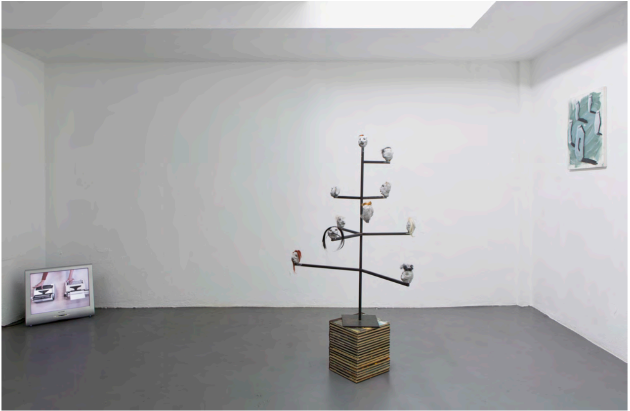
Installationsansicht / installation view, Photo: Tamara Lorenz