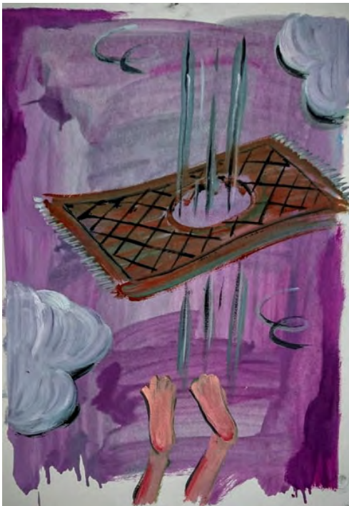
Pim Blokker, untitled, 2015 70 x 50 cm, oil on canvas, Euro 2.100,-