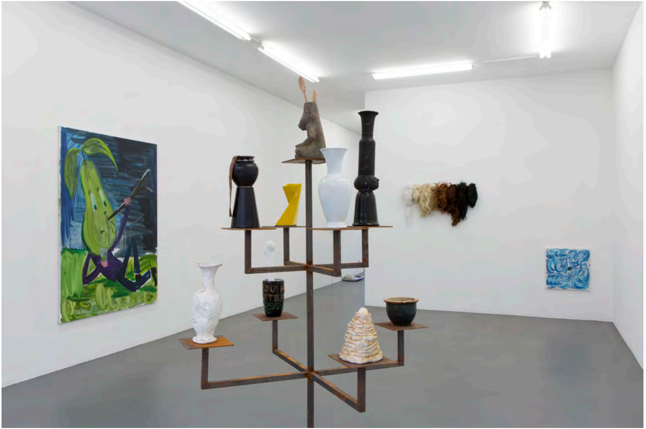
Installationsansicht/ installation view, Photo: Tamara Lorenz