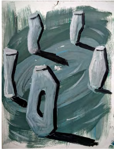
Pim Blokker, »Stonehenge«, 2015 50 x 40 cm, oil on paper on wood, Euro 1.600,-