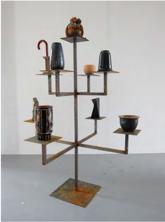
Frank Koolen, »Vasen-Phasen (Für die Blumes), 2016 170 x 110 x 100, Metall, Ton, Farbe, Keramik, Holz, Baumwolle, Geld, Papierband, Plastik, Kleber / metal, clay, paint, ceramics, wood, cotton, money, paper tape, plastic, glue Euro 3500,-