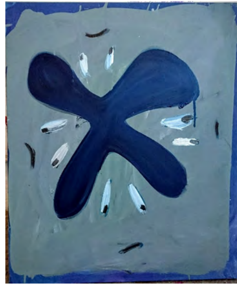
Pim Blokker, untitled, 2015 60 x 50 cm, oil on canvas, Euro 1.900,-