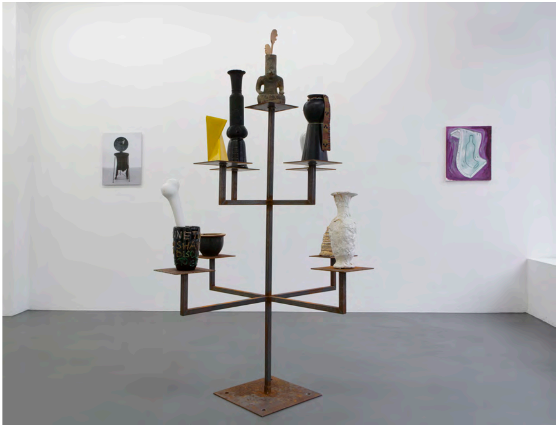
Installationsansichten / installation views