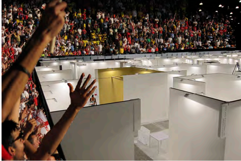
Dina Danish, »An Audience in Hiding«, 2013 Einkanal Video/ single-channel video, 16:01 min, Euro 4.400,-