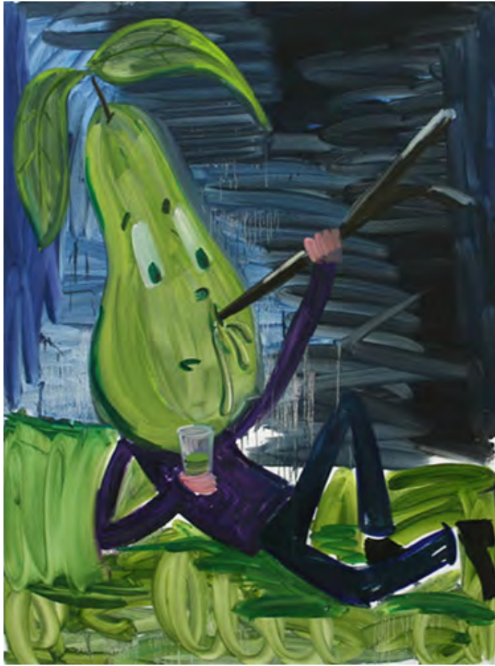
Pim Blokker, »Juicy Scumbag«, 2013 160 x 120 cm, oil on canvas, Euro 4.800,-