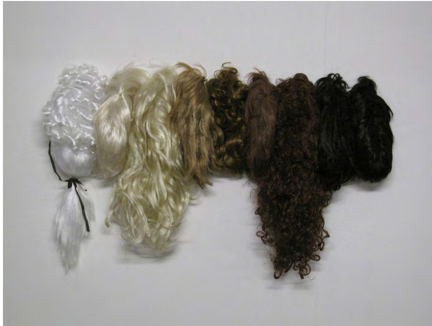
Frank Koolen, »Gradient«, 2009 65 x 110 x 9 cm, Perücken / Wigs Auflage von / edition of 3 + 1, Euro 880,-