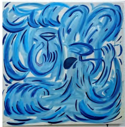
Pim Blokker, untitled, 2015 50 x 50 cm, oil on canvas, Euro 1.700,-