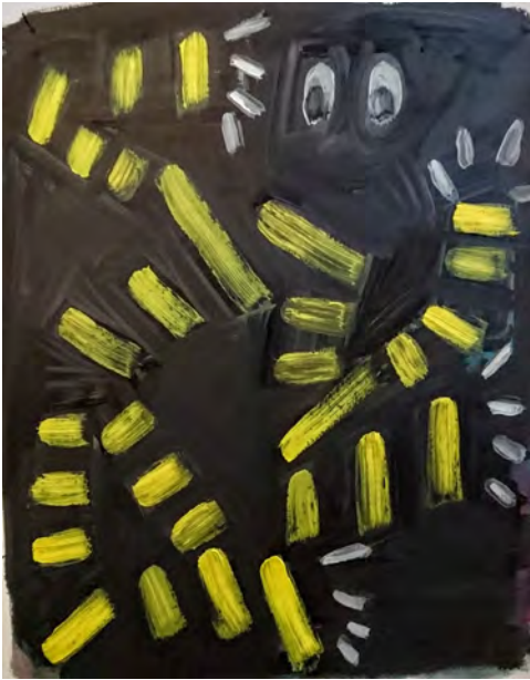
Pim Blokker, »Doing for life«, 2015 50 x 40 cm, oil on canvas, Euro 2.100,-